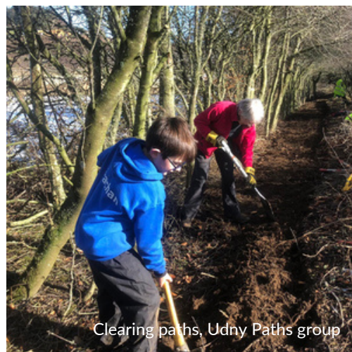
Clearing paths, Udny Paths group

Local newsletters, The Pitmedden News and TBC (Tarves and Barthol Chapel Newsletter) are produced quarterly and the church provides regular articles for them both. These are distributed to every household in the parish.