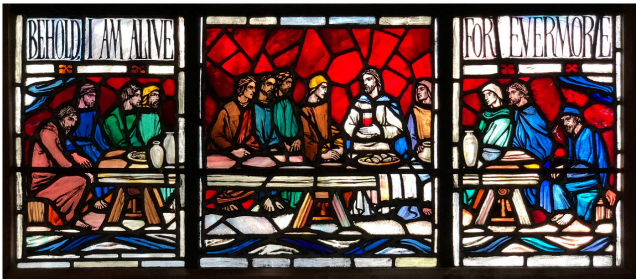
Detail from stained glass in Tarves Kirk

An order of service is available on our website and a printed version is delivered to those unable to join us in person.