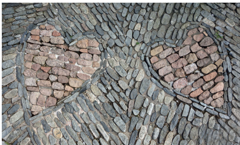
Paving, Pitmedden Garden

A new model of pastoral care is being developed in our new church with a Pastoral Care Team. The old practice of pastoral care being delivered by elders to districts had become fragmented. Pastoral work in future will be reliant on the Pastoral Care Team supporting the Minister.