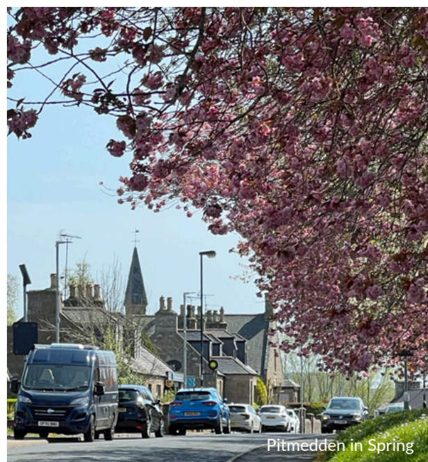
Pitmedden in Spring

Pitmedden has a population of over 1400. Amenities include village hall, the Medan Centre, sheltered housing complex, well stocked Co-op, Thai takeaway, public house, garage, bowling green, tennis court and playing fields. Nearby are a sheltered workshop, café with coffee roastery, farm shop and whisky shop.