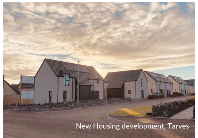
New Housing development, Tarves