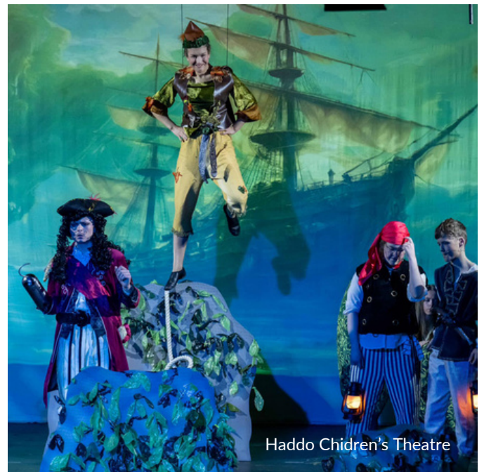
Haddo Children's Theatre