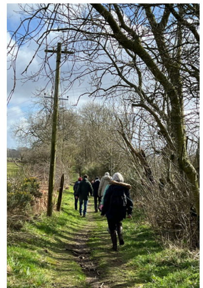
Palm Sunday Walk – Tarves to Pitmedden

How many: 23 Age profile: mainly over 50 Gender mix: approx 50/50