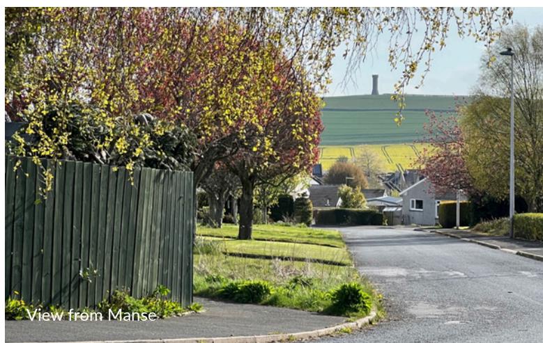
View from Manse