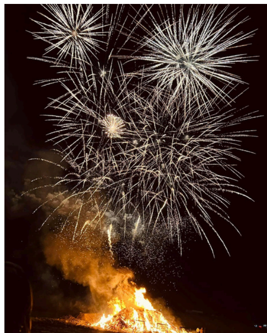
Annual bonfire and fireworks

Udny Glebe is currently let for agricultural use.