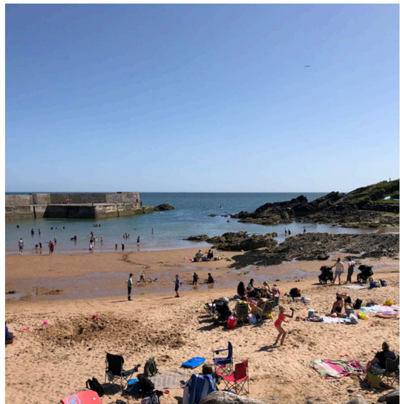
Collieston – popular nearby beach