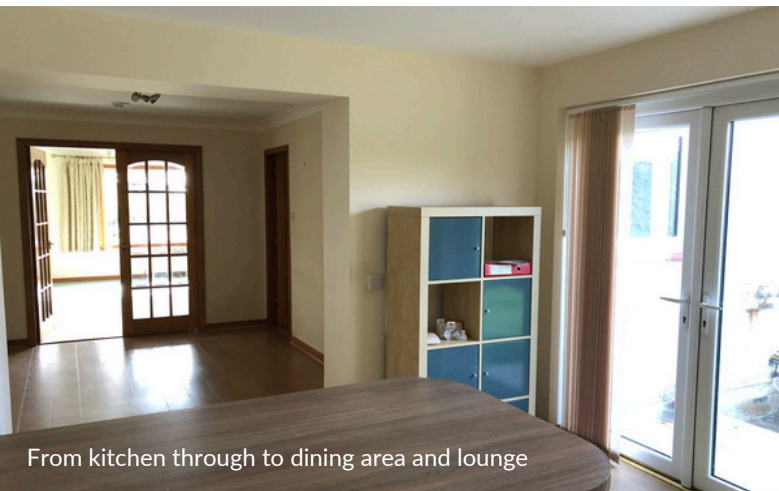
From kitchen through to dining area and lounge