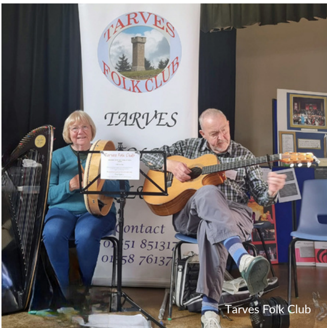
Tarves Folk Club